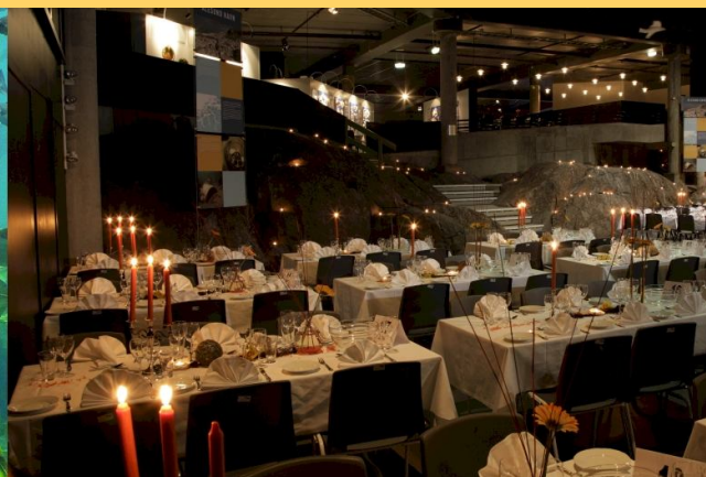
The ECCS Annual Dinner in the Atlantic Sea Park