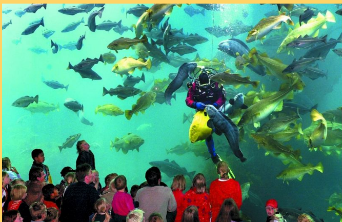
The Atlantic Sea Park, Aalesund