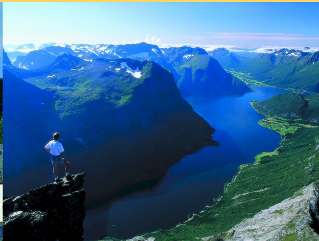
Beautiful Hjørund Fjord